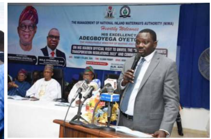
Hon. Ojotu Ojema Chairman House Committee on Inland Waterways