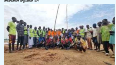
A group photograph of NIWA Staff and Boat operators in Kano river side.