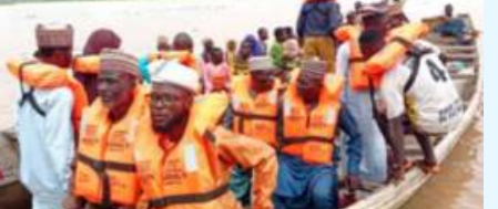
Demonstration on how to wear a life jacket during sailing.