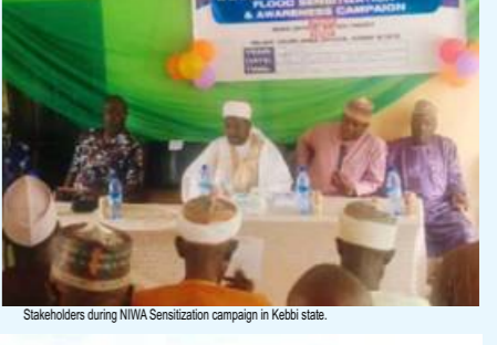
Stakeholders during NIWA Sensitization campaign in Kebbi state.