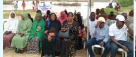
Stakeholders during NIWA Sensitization campaign in Kaduna state.