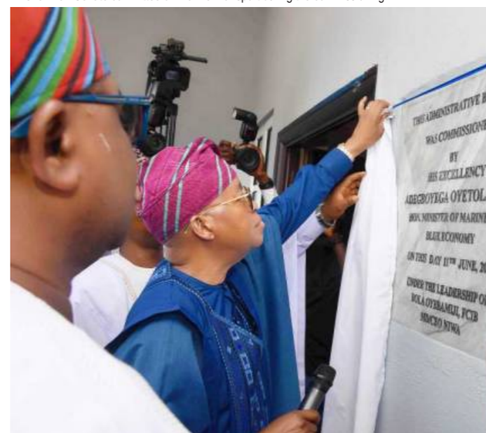
H.E. Adegboyega Oyetola Commissions projects during the visit to NIWA Headquarters