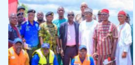
Sensitization Campaign organized by Onitsha Area office with stakeholder