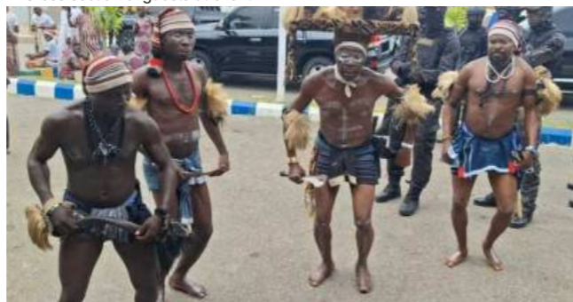
Uhafia Cultural Troup