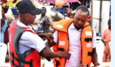
NIWA Staff demonstrating to stakeholders on how to wear a life jacket.