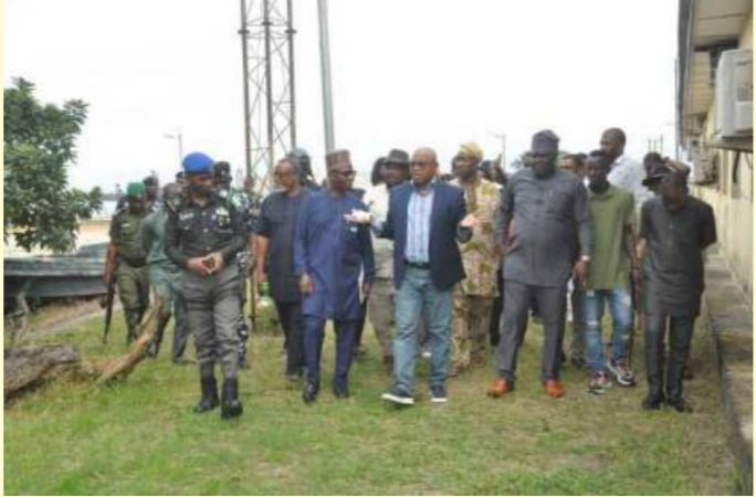
NIWA MD tours Port Harcourt Area Office