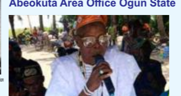
A stakeholder contributing during Sensitization campaign in Abokuta Area office