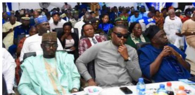
Cross section of guests at event