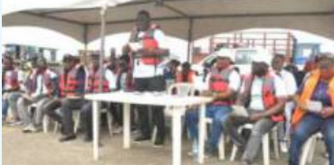
Sensitization Campaign organized by NIWA Port Harcourt Area Office