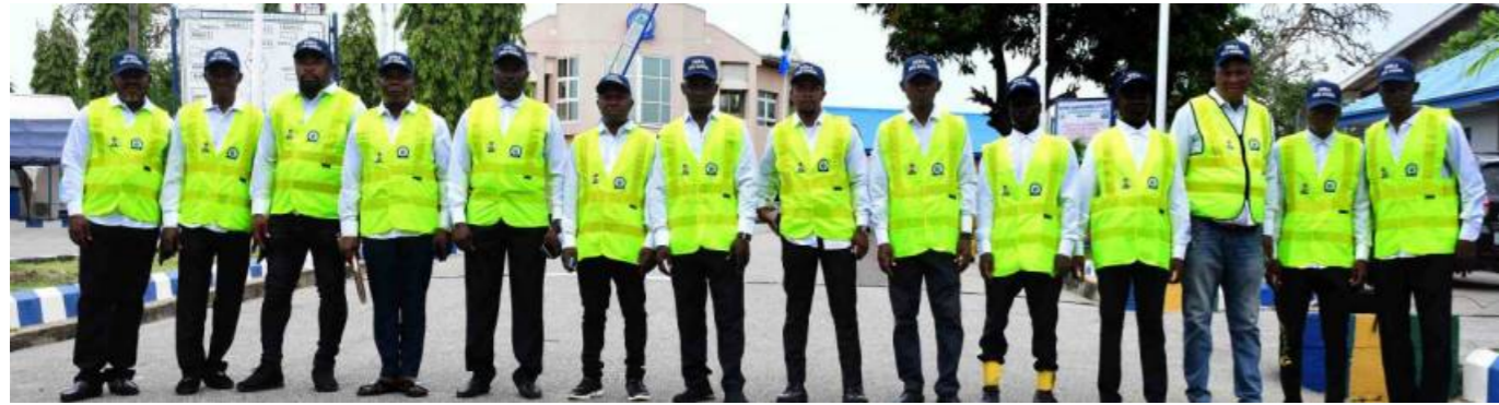
NIWA River Marshalls

enforcement. This is why we are launching the first phase of the water marshal initiative today. These officers were carefully selected to provide information daily to users of the waterways at selected jetties and loading points. They must ensure that all users comply strictly to safety regulations always.