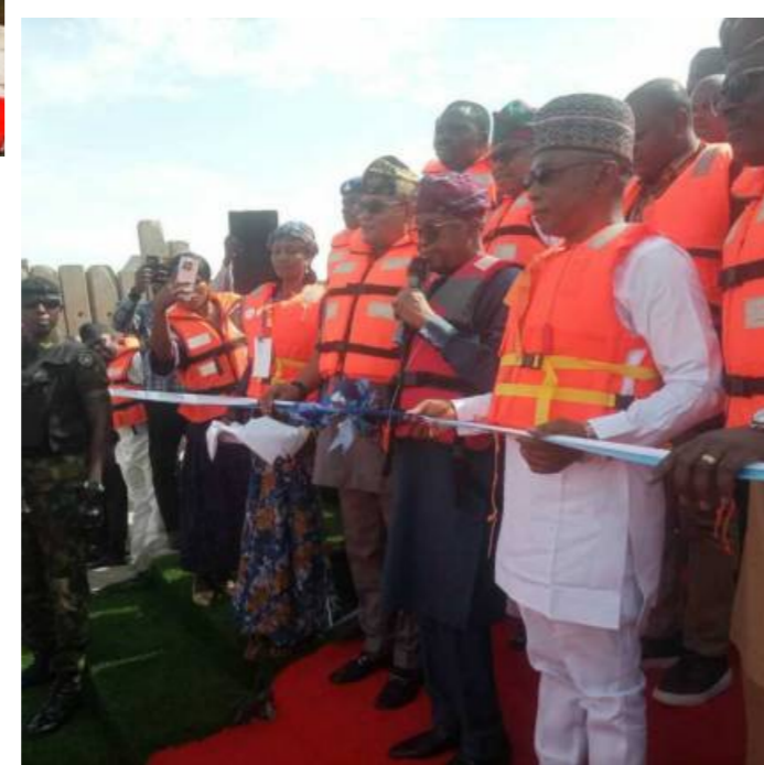
The Honourable minister of Marine and Blue Economy cutting the tape to commissioned the 62 seater passenger ferry and other crafts at NIWA dockyard, Lokoja