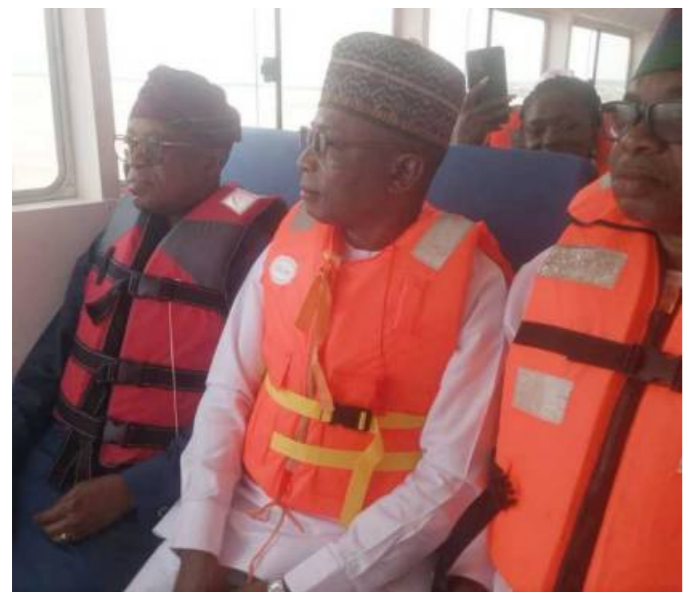
The Honourable Minister, Deputy Governor of Kogi state and MD NIWA, inside the commissioned 62-seater passenger ferry