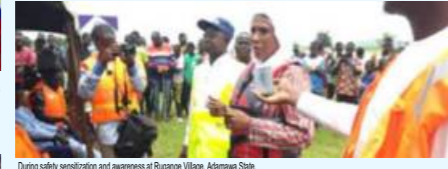
Durry safety sensitization and awareness at Rungwa Village, Adamawa State