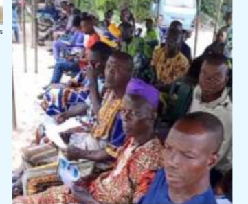
Stakeholders during NIWA Sensitization campaign in Abokuta.