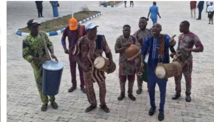
Drummers from osun state