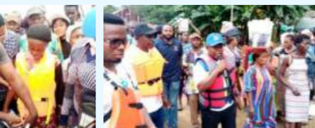
A stakeholder shown how to wear a life jacket