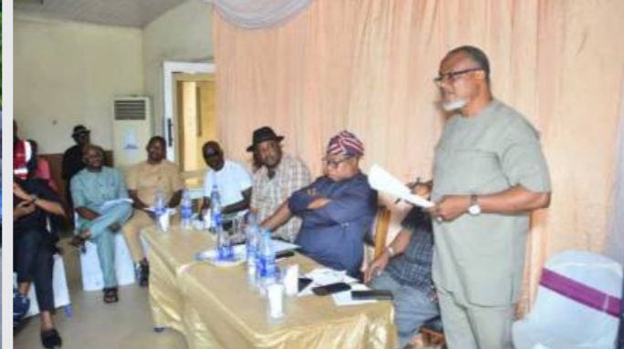
NIWA MD tours Onitsha Area Office and Port complex