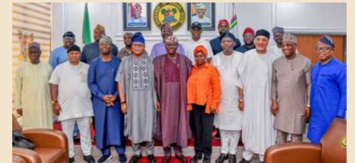
The Senate Committee on Marine Transport led by its Chairman Sen Wasiu Eshinlokun paid a courtesy visit to The Executive Governor of Lagos State, Mr. Babajide Sanwo-Olu