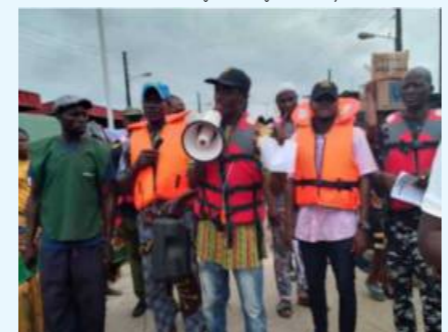
Sensitization Campaign organized by Igbokoda Area office.