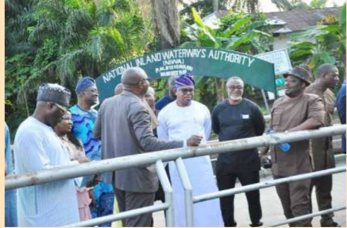
NIWA MD tours Warri Area office