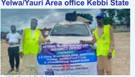
NIWA staff during the Sensitization campaign in Kebbi state.