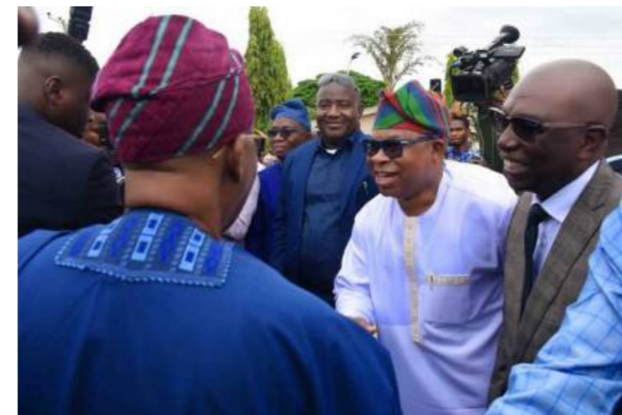
The MD of NIWA and the DG NIMASA welcomed the Honourable Minister to NIWA headquarters Lokoja