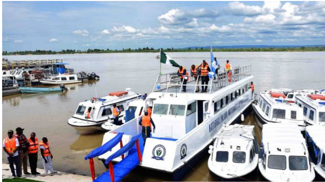
62-seater passenger ferry and other water crafts were commissioned by the Honourable minister