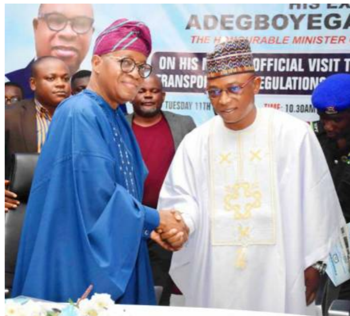
Honourable Minister Adegboyega Oyetola in handshake with Comrade Joel Salifu Joel Oyibo, Deputy Governor of Kogi State

According to the Honourable Minister, effective implementation of the Code was one of the directives he gave