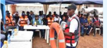
NIWA Staff demonstrating to stakeholders on how to use a life buoy.