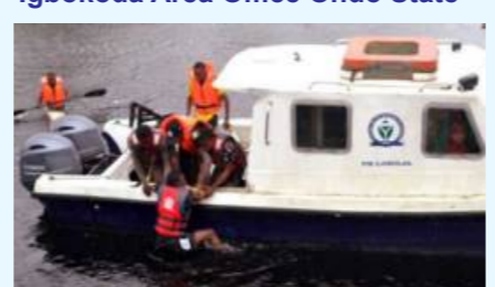
Demonstration of a rescue mission while using life jacket in Igbokoda waterways.