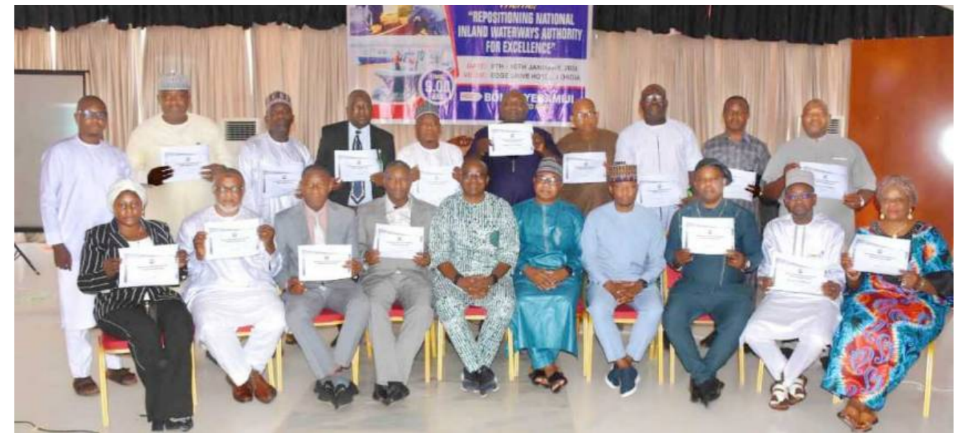
NIWA management signed and displayed their performance bond certificates.