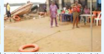
Demonstration on the proper use of Life Jacket and Life Buoy by the Unit Chairman of Safe Journey Beach Oron