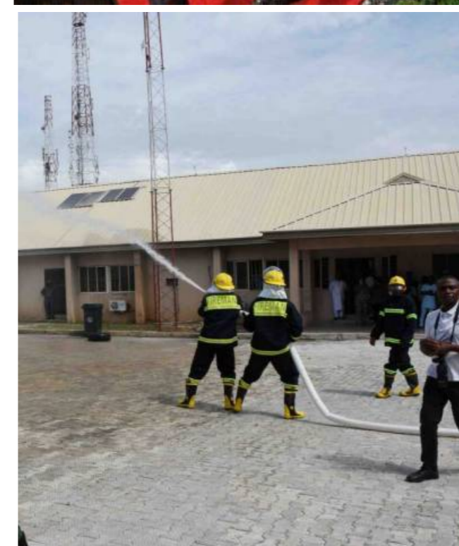
Fire service demo