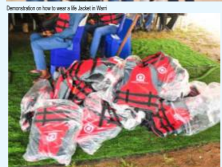
Free life jackets donated to stakeholders by NIWA in Warri.