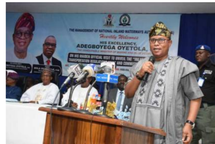
Sen. Wasiu Eshinlokun Chairman Senate committee on Marine Transport