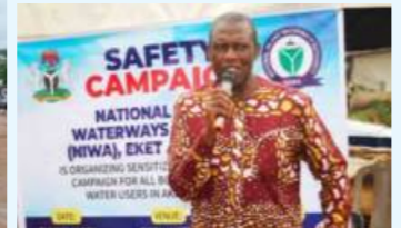
Unit Secretary of The Maritime Worker's Union of Nigeria Safe Journey Beach, Oron