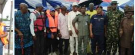
Sensitization Campaign organized by NIWA Yenagoa Area Office