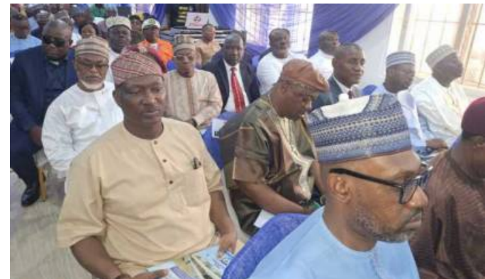
Cross section of NIWA Management staff at the event