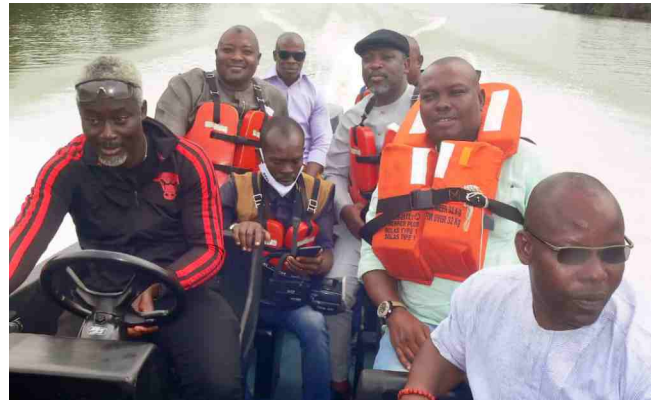
NIWA staff sailing to Burutu river port on MD's maiden visit

Moghalu said the concern of the Federal government was to make the port functional in line with its diversification policies.