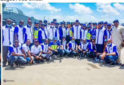
MD NIWA with some management staff, Area Manager Lagos and staff of the Area Office.