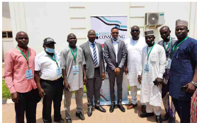
Cross section of selected NIWA staff trained in Administration and Management of Electronic Registration Information System (ERIS) at Abuja