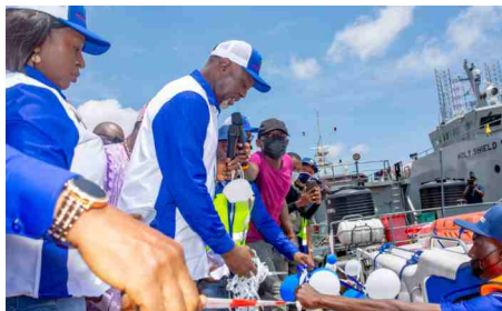
MD NIWA cutting the tape as he commissions the three patrol boats at Lagos