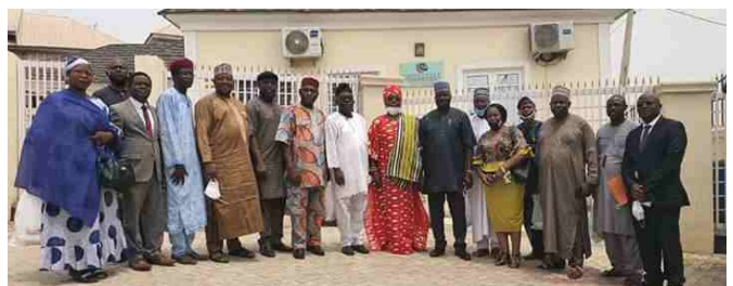
NIWA Staff and some guests at the official opening of the Confluence Logistics and Transport Consults LTD