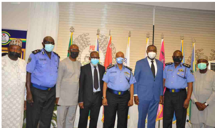
A group photograph with Inspector General of Police Usman Baba Alkali, MD of NIWA Chief Dr. George Moghalu and some Management staff of NIWA at Force Headquarters Abuja