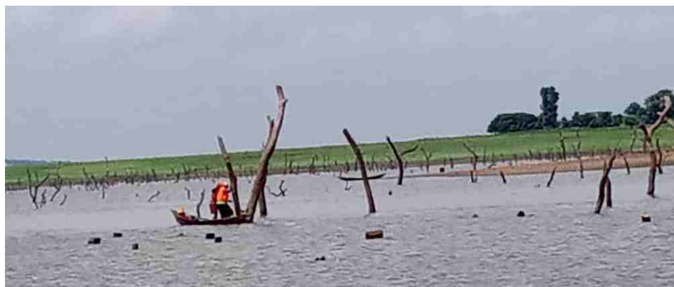
Pictorials of men at work during cutting down of logs and trees within the navigable Inland waterways of Malale towards Shagunu and Garafini, Niger State