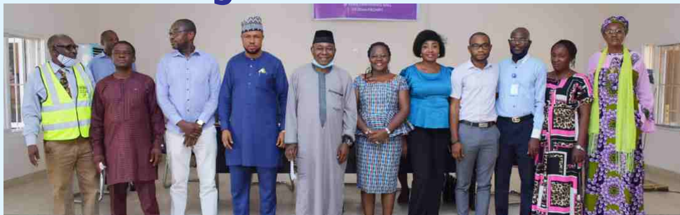
The new CILT Exco in a group photograph

The Chartered Institute of Logistics and Transport (CILT), Lokoja Branch has inaugurated its new Exco to pilot the affairs of the Branch for the next two years after a successful election held at the NIWA Headquarters, Lokoja.