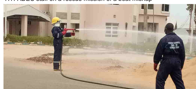
Fumigation of NIWA headquarters against Covid-19