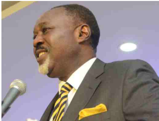
The MD of NIWA Chief Dr. George Moghalu presenting his speech at the 46th Birthday symposium of Gov. Yahaya Bello at Government house Lokoja, Kogi state

The Managing Director Chief (Dr.) George Moghalu has attributed the eroding of family values as a fundamental challenge to the current insecurity in the country.