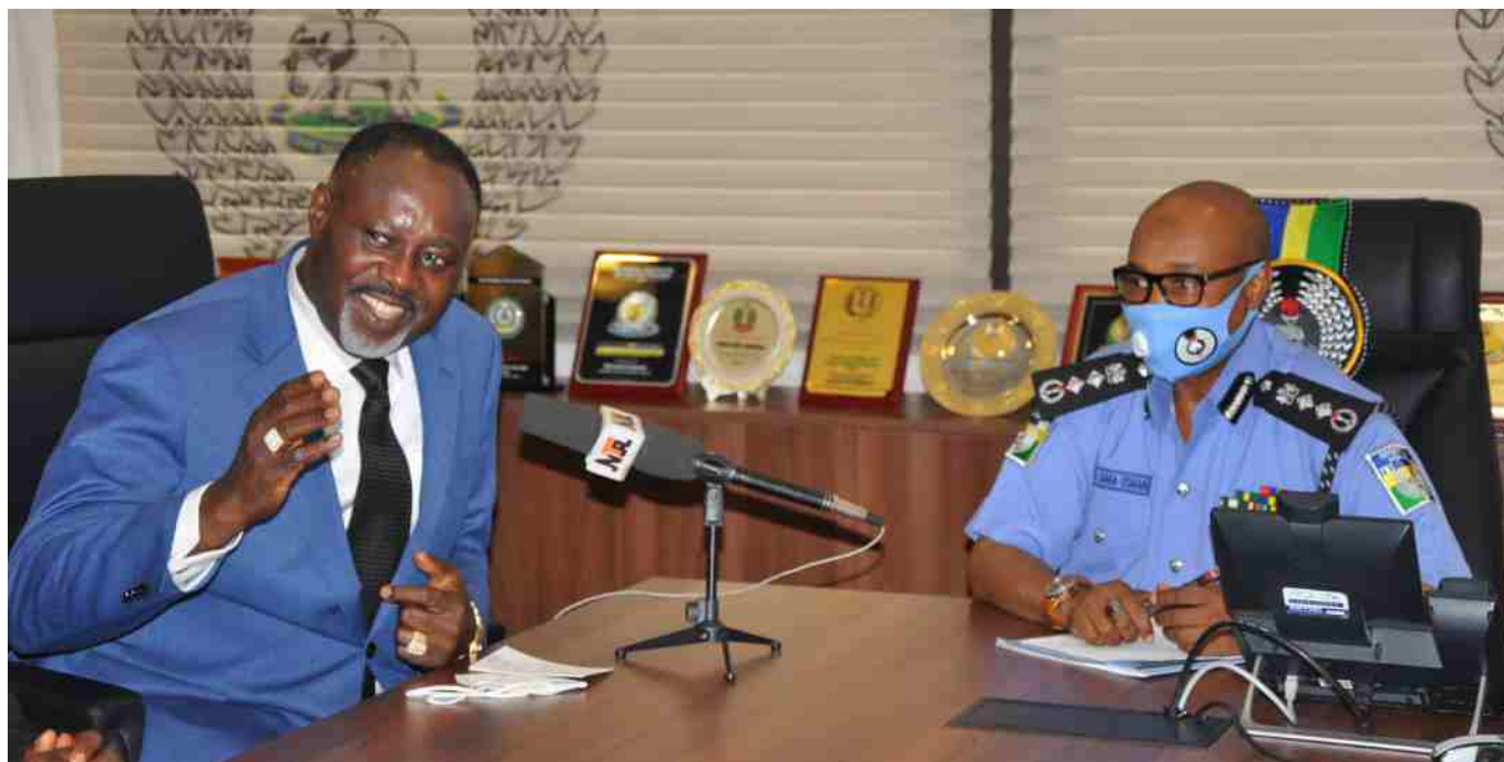
MD of NIWA Chief Dr. George Moghalu (left) in a discussion with th IG of Police Usman Baba Alkali at Force HQ Abuja