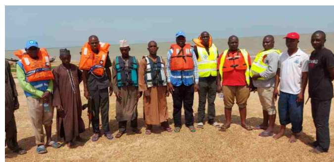
NIWA Niger-Kwara Area office team in Malale, New Bussa alongside HYPADDEC staff on a rescue mission of a boat mishap