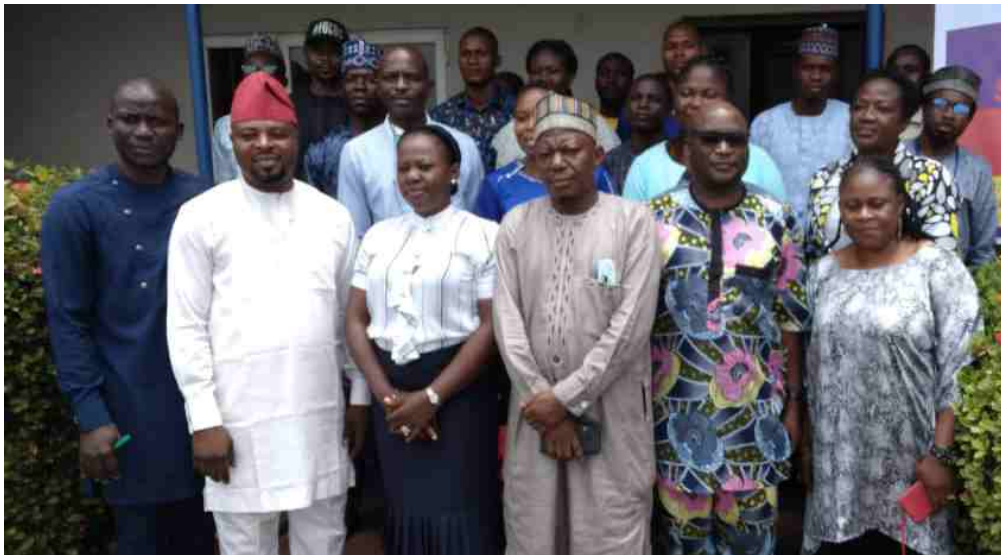
The newly inaugurated SERVICOM officers in a group photograph