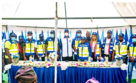
A group photograph of the newly innugrated taskforce with MD NIWA